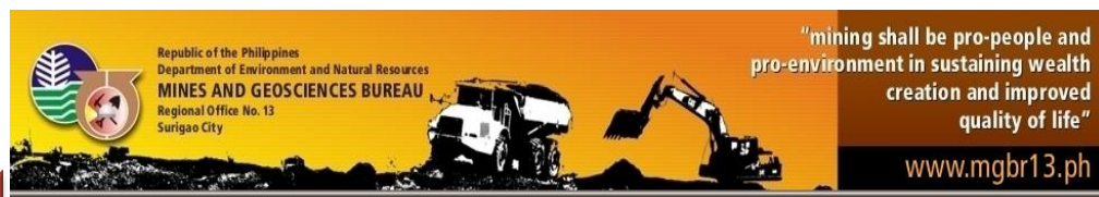
Header of the MGB R-XIII Official Website

www.mgbr13.ph is the Official website of MGB R-XIII