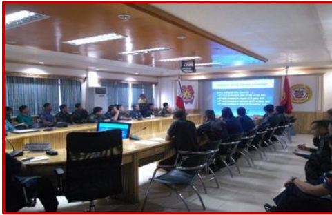
Mining Law in the Philippines for the Philippine Army Officers and Staff of 402 Brigade Headquarters, Butuan City

MGB13 is operating two (2) weekly radio programs. One (1) hour time slot is aired every Friday, 11:00 A.M. to 12:00 P.M. at station dxSN – Catholic Media Network (CMN) and thirty (30) minutes every Saturday at station dxKS – Radio Philippines Network (RPN). The Chamber of Mines of Caraga, Inc. has contributed an ample amount in subsidizing the financial requirement of airing these broadcasts.