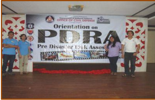
MGB 13 team during the PDRA Orientation