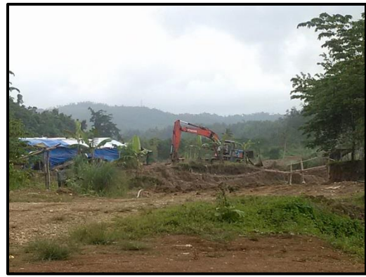
Site of the alleged illegal ssm in Brgy. Tambis, SDS where MGB 13 conducted a field investigation.