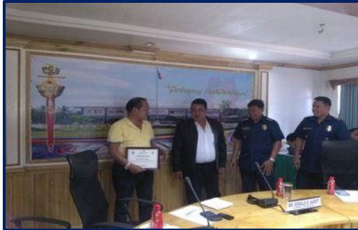
MGBR13 Takes Part on PNP Seminar against Environmental Terrorism