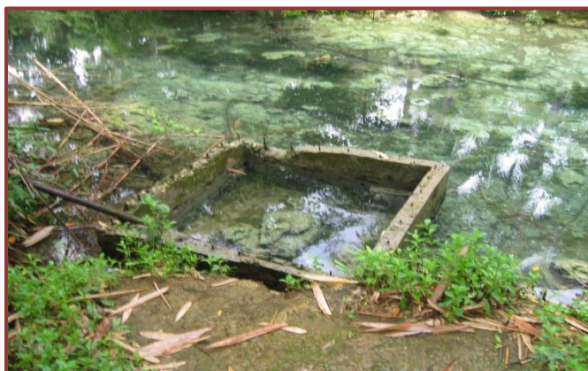
Groundwater assessment at Jabonga, Agusan del Norte

Groundwater Resources Assessment was conducted at the Municipality of Jabonga, Province of Agusan del Norte.