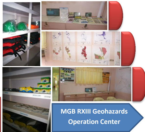
MGB RXIII Geohazards Operation Center

Caraga Region is one of the areas in the country where it is prone in all types of weather disturbances. Geohazards Operations Center equipped with various types of emergency equipment's is a kind of facility needed to be established in the region. Fortunate enough, MGB RXIII was able to establish the said Geohazards Operations Center and is now operational.