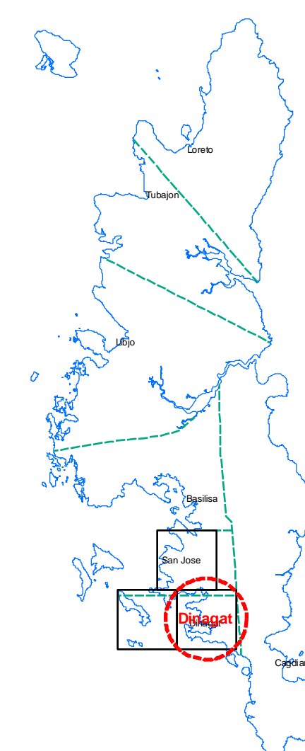
DINAGAT PROVINCE INDEX MAP