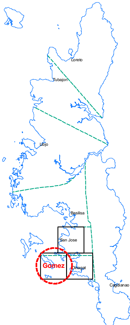
DINAGAT PROVINCE INDEX MAP