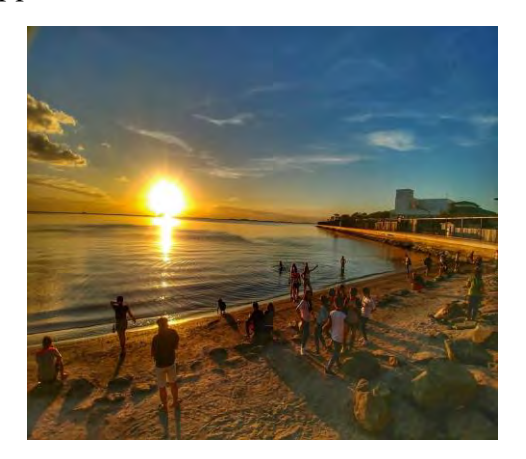
SUNSET ON MANILA BAY And possibly gleaming on the white sand.

But Paris Plages is only a temporary scheme. The beaches are there for the whole month of August, sometimes starting earlier in July, sometimes extending a few days into September. But it has been a major success, a brilliant scheme in city planning. In 2007, summer visitors attributed to these temporary beaches topped four million.