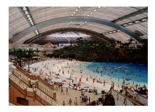
INDOOR BEACH The now defunct 850-acre resort Seagaia Ocean Dome on the southern island of Kyushu in Miyazaki, Japan.

But if ever, Manila Bay beach won't be the first of such projects in the world, especially in landlocked cities. There's Paris Plages, for one. There's also Sunny Beach in Shanghai, set up in 2010 as an additional attraction to the South Bund. Now (at least before the pandemic), it's a party destination, with beach bums coming in droves to eat, drink, dance, and dig their toes in the sand. Until 2007, there was a heated, indoor beach in Kyushu, Japan. It was called the Seagaia Ocean Dome that boasted of sand and palm trees, as well as a retractable fake roof in which the sky was permanently blue and a fake volcano spitting fake fire. Even the Maldives, paradise for sun worshipers and beach lovers, has an artificial beach in Male, its capital, which is now a popular venue for parades, live music, sports events, and community parades.