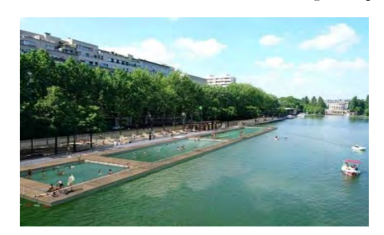
LA PLAGE TEMPORAIRE Floating pools on the banks of the artificial lake at La Villete in the northeast of Paris

But Paris Plages is only a temporary scheme. The beaches are there for the whole month of August, sometimes starting earlier in July, sometimes extending a few days into September. But it has been a major success. In 2007, summer visitors attributed to these temporary beaches topped four million.