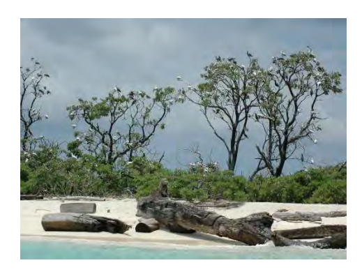
Tubbataha Reefs Natural Park

Lonely Planet, the largest travel guide book publisher, has cited two of the country's famous dive spots as among the six national parks around the world with offer a "surprisingly spectacular diving" experience.