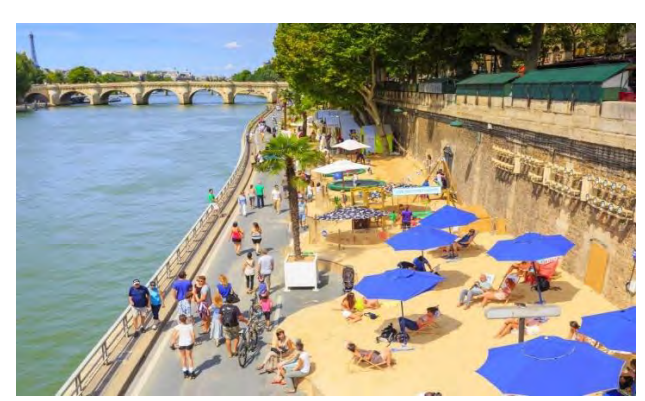
PARIS ON THE SAND Paris Plage on a stretch of the Seine riverbank.

It's not a new idea. In 2002, the French capital introduced the idea of the "Paris Plage," which later became "Paris Plages" or Paris Beaches. Just like here in Manila, just like now, the moment the Parisians, critical by default, caught sight of then Paris Mayor Bertrand Delanoë trucking sand, along with palm trees, into the city, they were up in arms, lamenting the frivolity as well as the cost of the project.