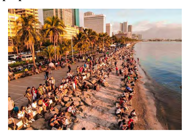
BEACH IN THE CITY The baywalk on Manila Bay after its rehabilitation last year.

Artificial beaches have a purpose—and here are others from all over the world