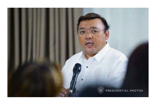
Presidential Spokesperson Harry Roque

Citing information from the Department of Environment of Natural Resources (DENR), Presidential spokesman Harry Roque said crushed "dolomite boulders" are actually being used in the rehabilitation project.