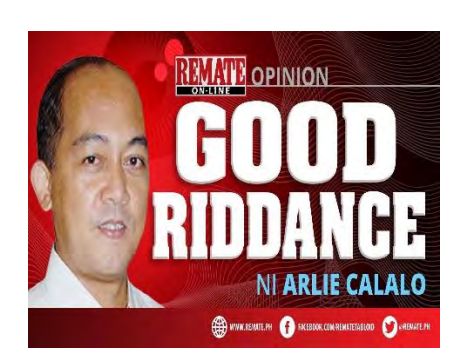
September 5, 2020 @ 12:28 AM 6 hours ago

THE white sand being applied alongside Manila Bay coastline was part of the national government's P<sub>3</sub>89M Manila Bay beach nourishment project that started two years ago and the best way to discourage people from littering and throwing trash in the water.