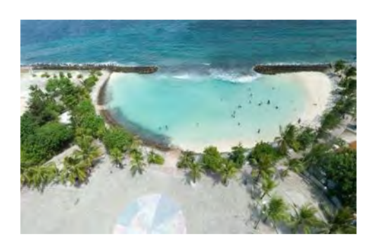
NO BEACH, NO PROBLEM Although it is the capital of a beach paradise, the Maldives, Male has no decent beach of its own, so it built an artificial beach, now a popular venue for parades, live music, sports events, and community parades

Also the sand isn't exactly sand, but crushed dolomite boulders from Cebu, as DENR clarified. We have yet to know if, just like sand, whose mining to create or expand distant beaches is tricky, if not illegal, crushed dolomite is prone to erosion and how it will interact with the eco-system of Manila Bay.